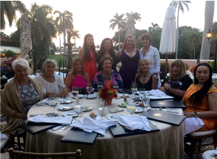
The Quattro Firm enjoying supper club at Mar-A-Lago