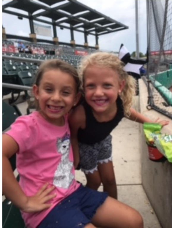
The Quattrocchi and Mondone families support local teams and take the kids to watch local Jupiter baseball teams.