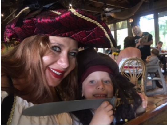
The Quattrocchi family celebrated the summer in the Palm Beach Zoo's Safari Nights' Pirate Night