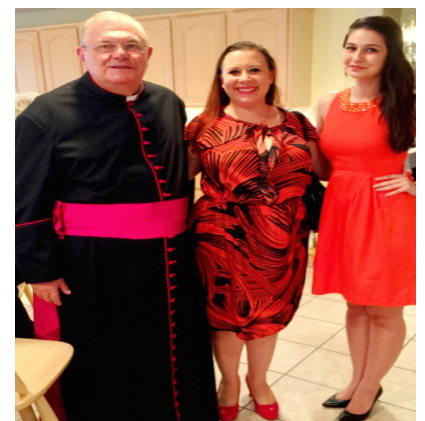
The Quattro firm was thrilled to join The Guild of St. Edward's Church in a new members tea.