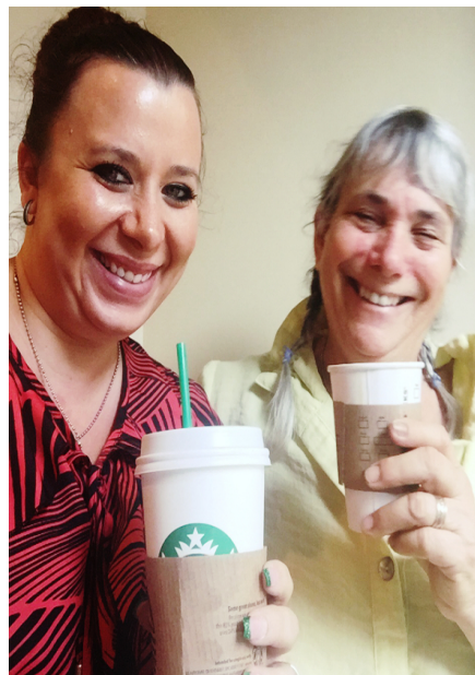
Much needed caffeine break

Family Law & Domestic Relations Marital Contracts Civil Litigation Commercial Litigation Corporate Matters Business Formation Contract Drafting & Review General Litigation LGBT Issues & Custody Estate Planning Wills & Trusts