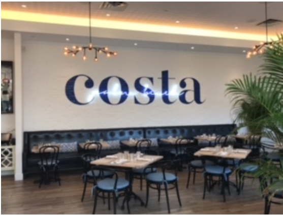
Nicole Quattrocchi celebrated Ladies' Night at Costa in Palm Beach.